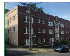
$5,800,000 Multifamily Dallas, TX Freddie Mac SBL 5 year hybrid 5 year term Cash-out refinance