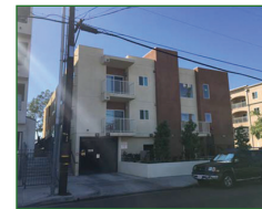
$23,600,000 Multifamily Portfolio Los Angeles, CA Freddie Mac SBL 5 year hybrid 20 year term Cash.out refinance